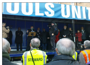
Speakers at the rally