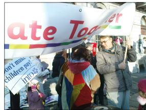
Educate Together getting their banner ready!