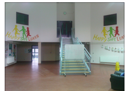
Our "grand" entrance