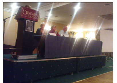
Speakers at the parents' information evening in the Dolmen Hotel